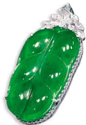
68 Jadeite “Leaf” and Diamond Pendant, mounted in 18K white gold Accompanied by certificate from HKK Jade and Jewellery Laboratory Limited 天然翡翠「金枝玉葉」鑽石吊咀鑲 18K 白金 附香港九龍翡翠珠寶鑑定中心有限公司證書 翡翠尺寸：約 33 x 20 毫米，9 粒鑽石共重約 0.60 卡拉 60 粒鑽石共重約 0.50 卡拉 吊咀尺寸：約 43 毫米