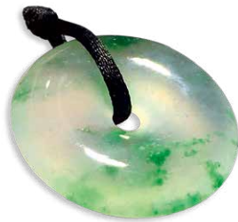
67 Jadeite “Disc” Pendant Accompanied by certificate from HKK Jade and Jewellery Laboratory Limited 天然翡翠「平安扣」吊咀 附香港九龍翡翠珠寶鑑定中心有限公司證書 翡翠尺寸：約 34 x 8 毫米