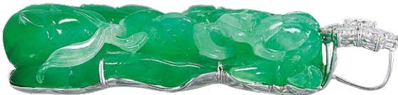
36 Jadeite and Diamond Pendant, mounted in 18K white gold Accompanied by certificate from HKK Jade and Jewellery Laboratory Limited 天然翡翠「魚魚得水」鑽石吊咀鑲 18K 白金 附香港九龍翡翠珠寶鑑定中心有限公司證書 翡翠尺寸：約 58.5 x 38.05 x 毫 15.1 米 7 粒鑽石共重約 2.62 卡拉 吊咀長度：約 73 毫米 HK$350,000-380,000