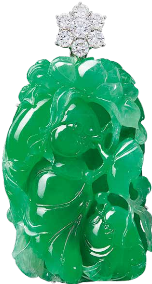
35 Jadeite “Peapod” and Diamond Pendant, mounted in 18K white gold Accompanied by certificate from HKK Jade and Jewellery Laboratory Limited 天然翡翠「福豆」鑽石吊咀鑲 18K 白金 附香港九龍翡翠珠寶鑑定中心有限公司證書 翡翠尺寸：約 32 x 11.5 x 5 毫米，1 粒鑽石重約 0.31 卡拉 246 粒鑽石共重約 1.44 卡拉 吊咀尺寸：約 39 毫米 HK$150,000-170,000