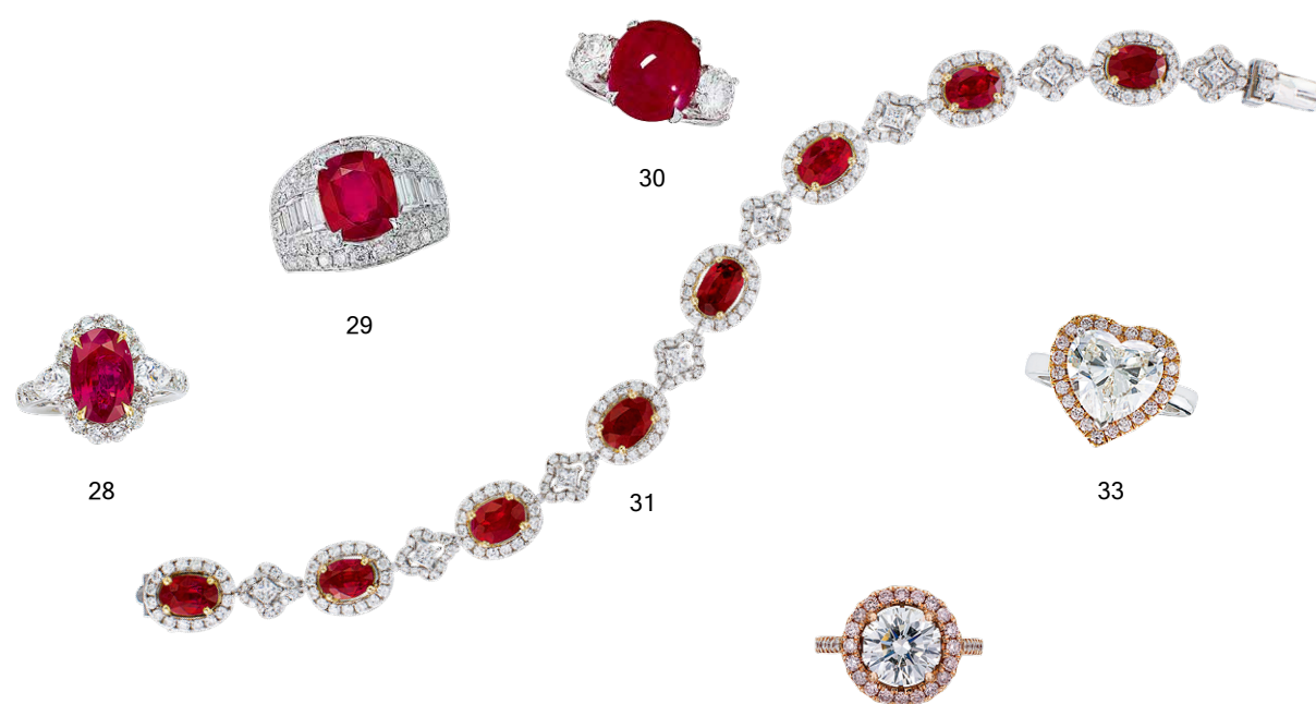
28 Ruby and Diamond Ring, the ruby weighing 2.65 carats, decorated with diamonds, mounted in 18K white gold, (no indications of thermal treatment), Ring size: 14 Accompanied by GRS certificate 2.65 卡拉「緬甸 - 抹谷」紅寶石配鑽石戒指鑲 18K 白金（沒有熱處理跡象） 附 GRS 證書 2.65 卡拉紅寶石，產地：緬甸 - 抹谷，顏色：紅色 1 粒紅寶石重 2.65 卡拉，24 粒鑽石共重約 1.63 卡拉 港指圈：14