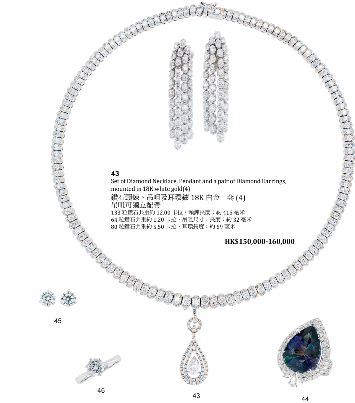
43 Set of Diamond Necklace, Pendant and a pair of Diamond Earrings, mounted in 18K white gold(4) 鑽石頸鍊、吊咀及耳環鑲 18K 白金一套 (4) 吊咀可獨立配帶 133 粒鑽石共重約 12.00 卡拉，頸鍊長度：約 415 毫米 64 粒鑽石共重約 1.20 卡拉，吊咀尺寸：長度：約 32 毫米 80 粒鑽石共重約 5.50 卡拉，耳環長度：約 59 毫米