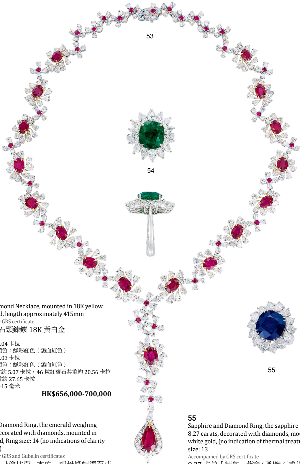
53 Ruby and Diamond Necklace, mounted in 18K yellow and white gold, length approximately 415mm Accompanied by GRS certificate 紅寶石配鑽石頸鍊鑲 18K 黃白金 附 GRS 證書 1 粒紅寶石重 3.04 卡拉 產地：緬甸，顏色：鮮彩紅色（鴿血紅色） 1 粒紅寶石重 2.03 卡拉 產地：緬甸，顏色：鮮彩紅色（鴿血紅色） 2 粒紅寶石共重約 5.07 卡拉，46 粒紅寶石共重約 20.56 卡拉 346 粒鑽石共重約 27.65 卡拉 頸鍊長度：約 415 毫米