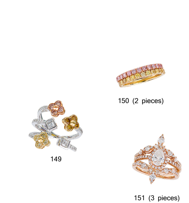
149 Multi-coloured Diamond and Diamond Ring, mounted in 18K tri-color gold, Ring size: 14 彩鑽配鑽石戒指鑲 18K 三色金 12 粒彩鑽共重約 0.80 卡拉，35 粒鑽石共重約 0.58 卡拉 港指圈：14