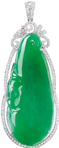
37 Jadeite “Ruyi” and Diamond Pendant, mounted in 18K white gold Accompanied by certificate from HKK Jade and Jewellery Laboratory Limited 天然翡翠「如意」鑽石吊咀鑲 18K 白金 附香港九龍翡翠珠寶鑑定中心有限公司證書 翡翠尺寸：約 43 x 25 x 3 毫米，181 粒鑽石共重約 0.60 卡拉 吊咀長度：約 61 毫米 HK$94,000-100,000