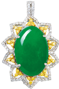
38 Jadeite “Fushou” and Diamond Pendant, mounted in 18K white gold Accompanied by certificate from HKK Jade and Jewellery Laboratory Limited 天然翡翠「福壽」鑽石吊咀鑲 18K 白金 附香港九龍翡翠珠寶鑑定中心有限公司證書 翡翠尺寸：約 51 x 21 x 5 毫米，128 粒鑽石共重約 0.80 卡拉 吊咀長度：約 68 毫米 HK$76,000-80,000