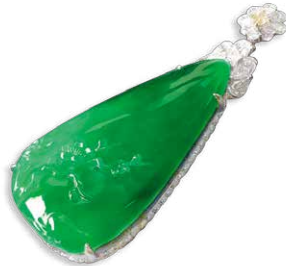
69 Jadeite and Diamond Pendant, mounted in 18K white gold Accompanied by certificate from HKK Jade and Jewellery Laboratory Limited 天然翡翠鑽石吊咀鑲 18K 白金 附香港九龍翡翠珠寶鑑定中心有限公司證書 翡翠尺寸：約 41.5 x 22.5 x 4.5 毫米，14 粒鑽石共重約 0.80 卡拉 80 粒鑽石共重約 0.60 卡拉，1 粒黃鑽重約 0.05 卡拉 吊咀尺寸：約 56 毫米