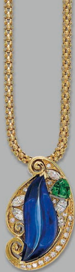
139 (2 pieces)