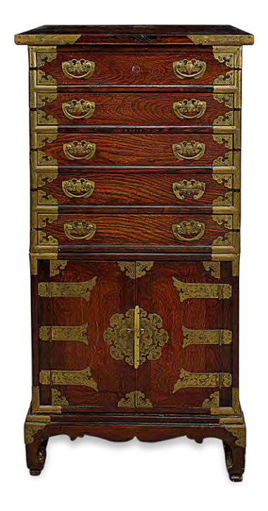
597 A wooden chest of drawer, 53 x 106 x 105(H) cm. 木抽屜櫃