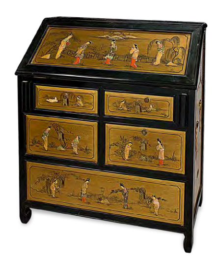
598 An enamel decorated writing desk, 90 x 41 x 104(H) cm. 木彩繪人物書桌