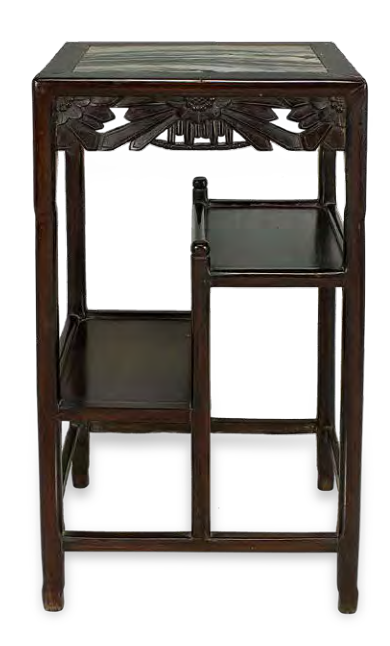
594 A blackwood inlaid marble stand, 40 x 30 x 71(H) cm. 酸枝鑲大理石几