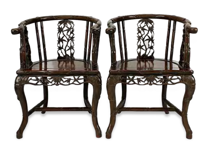
592 A pair of blackwood armchairs, 60 x 49 x 81(H) cm. 酸枝扶手圈椅一對