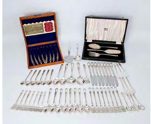
585 One lot of silverwares 銀及鍍銀餐具一組

銀及鍍銀餐具一組 鍍銀高腳杯十二個、燭台一對、小瓶一個、WM ROGERS 銀餐具三十九件、CB&S 銀大餐具 一套、日本劍式餐刀八把 (附盒)、食批餐具一套三件 (附盒)、鍍銀牛油刀七把、鉑片刀、 叉及餐匙兩隻