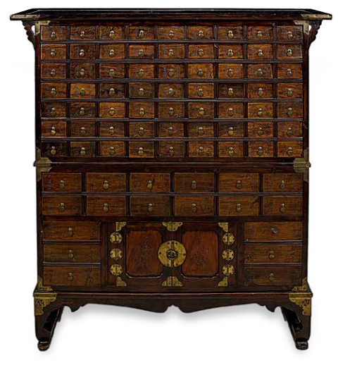
599 A Chinese herb wooden chest, 113 x 28 x 122(H) cm. 中藥櫃