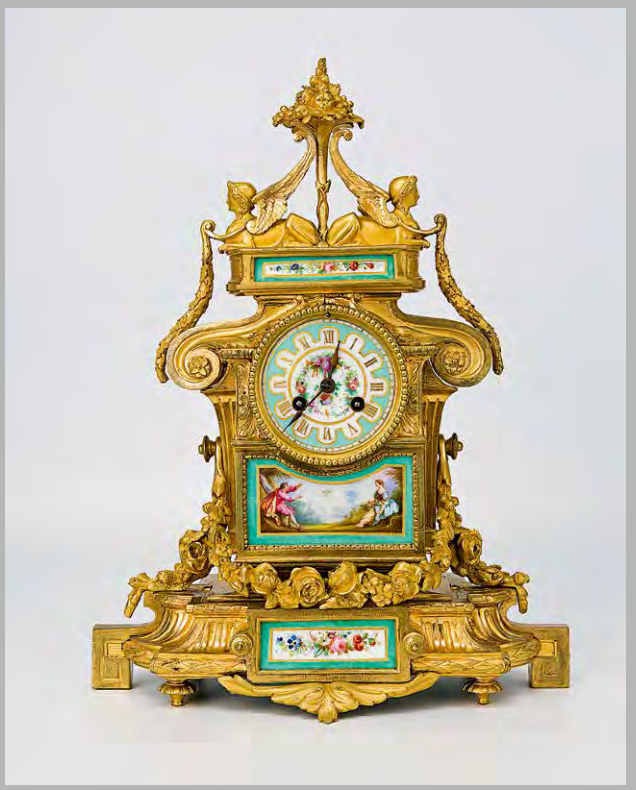
Parkin, 19th Century, an English gilt bronze travel clock. Height 135mm. Width 100mm. Depth 90mm. PARKIN 十九世紀 英國銅鎏金旅行鐘