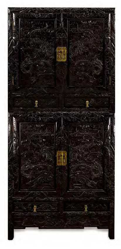
596 A peking wood carved four doors chest, 100 x 50 x 220.5(H) cm. 木刻龍紋四門大櫃