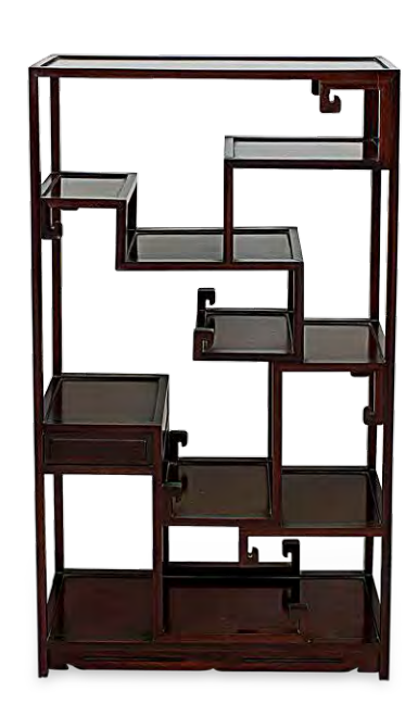
595 A rosewood antique stand, 47 x 17.5 x 83(H) cm. 花梨木多寶格