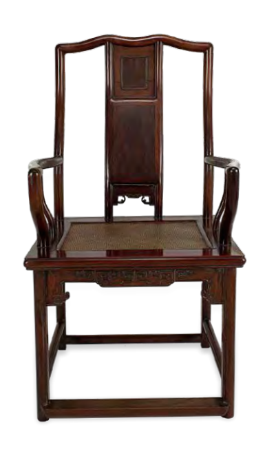
593 A rosewood armchair, 53 x 44 x 100(H) cm. 酸枝官帽椅一張