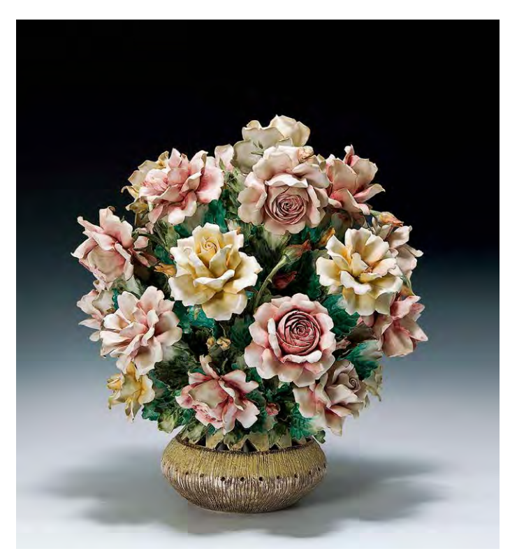
590 A stacked European porcelain roses with pot, 40 \times 43(H) cm. 歐洲堆瓷玫瑰花瓶