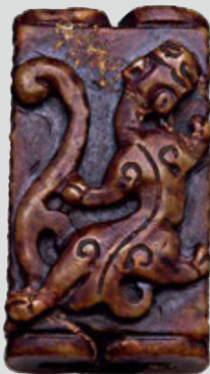
247 A BROWNISH JADE 'CHILONG' PENDANT, MING DYNASTY, 3 X 6 CM. 明 玉螭龍件 HK$3,000-5,000