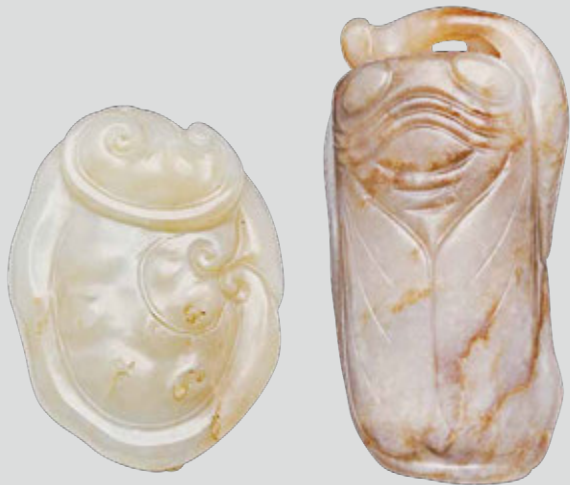
284 (2 pieces)

284 A GROUP OF TWO JADE ORNAMENTS, INCLUDING OF A CICADA PENDANT AND A LINGZHI PENDANT, 4.5 TO 6 CM. 玉蟬墜及玉靈芝墜