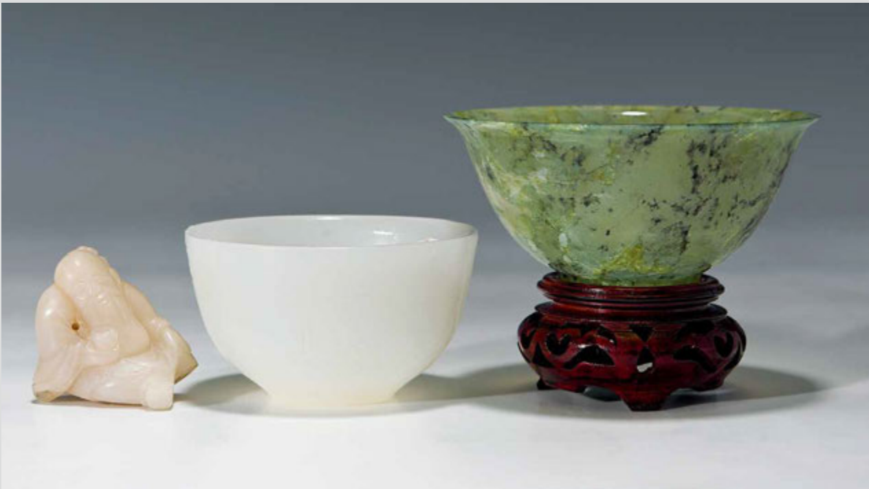
329 A GROUP OF JADE ORNAMENTS, QING DYNASTY, INCLUDING OF AN JADE ORNAMENT, A BOWL AND A GLASS BOWL, 4 TO 10 CM. 清 仙翁連料器碗、玉碗