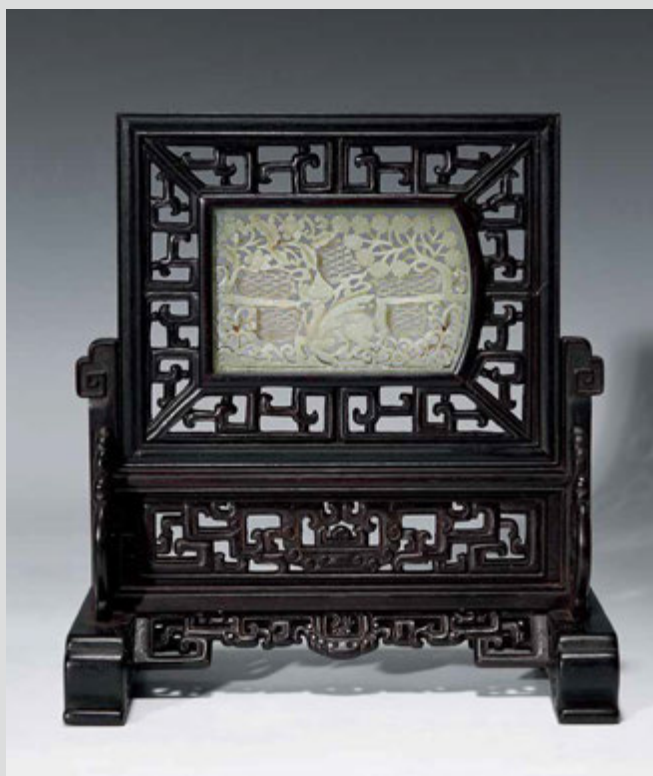
261 A CARVED WHITE JADE PLAQUE, MING DYNASTY, SET ON A ZITAN TABLE SCREEN, 9 x 5.5 CM. 明 白玉透雕麒麟帶版連梓檀木插屏