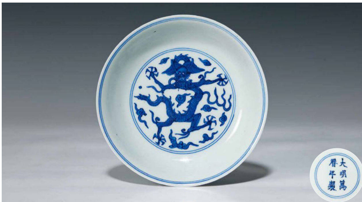
212 A BLUE AND WHITE 'DRAGON' DISH, WANLI MARK AND PERIOD, D: 15.5 CM. 萬曆 青花龍紋盤