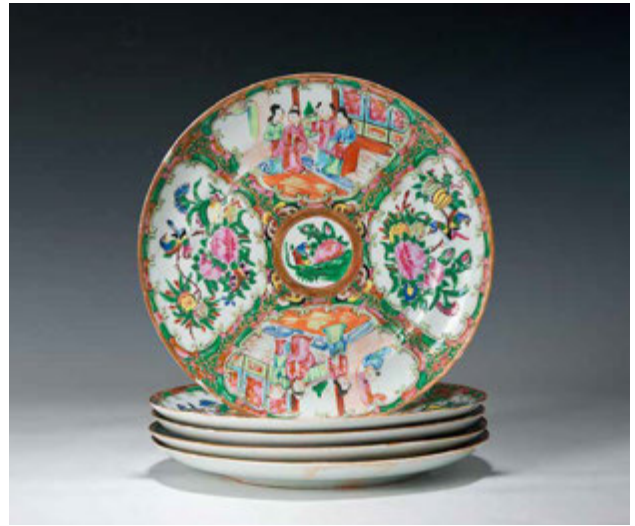
215 A SET OF FIVE CANTON ENAMEL DECORATED DISHES, 21.5 CM. 廣彩盤一套五件