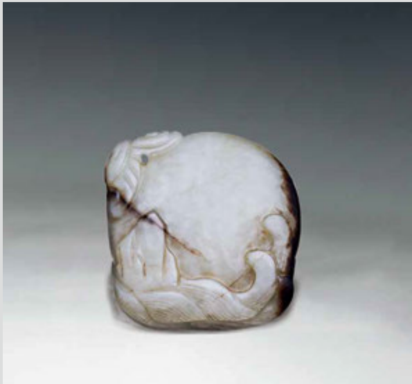
328 A GREYISH JADE BOULDER OF SEA WAVE AND ROCK, 3.5 X 3.5 CM. 海水雲紋山子