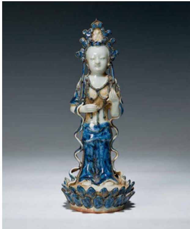
207 A BLUE AND WHITE STATUE OF GUANYIN, QING DYNASTY, H: 22.5 CM. 清 青花菩薩像