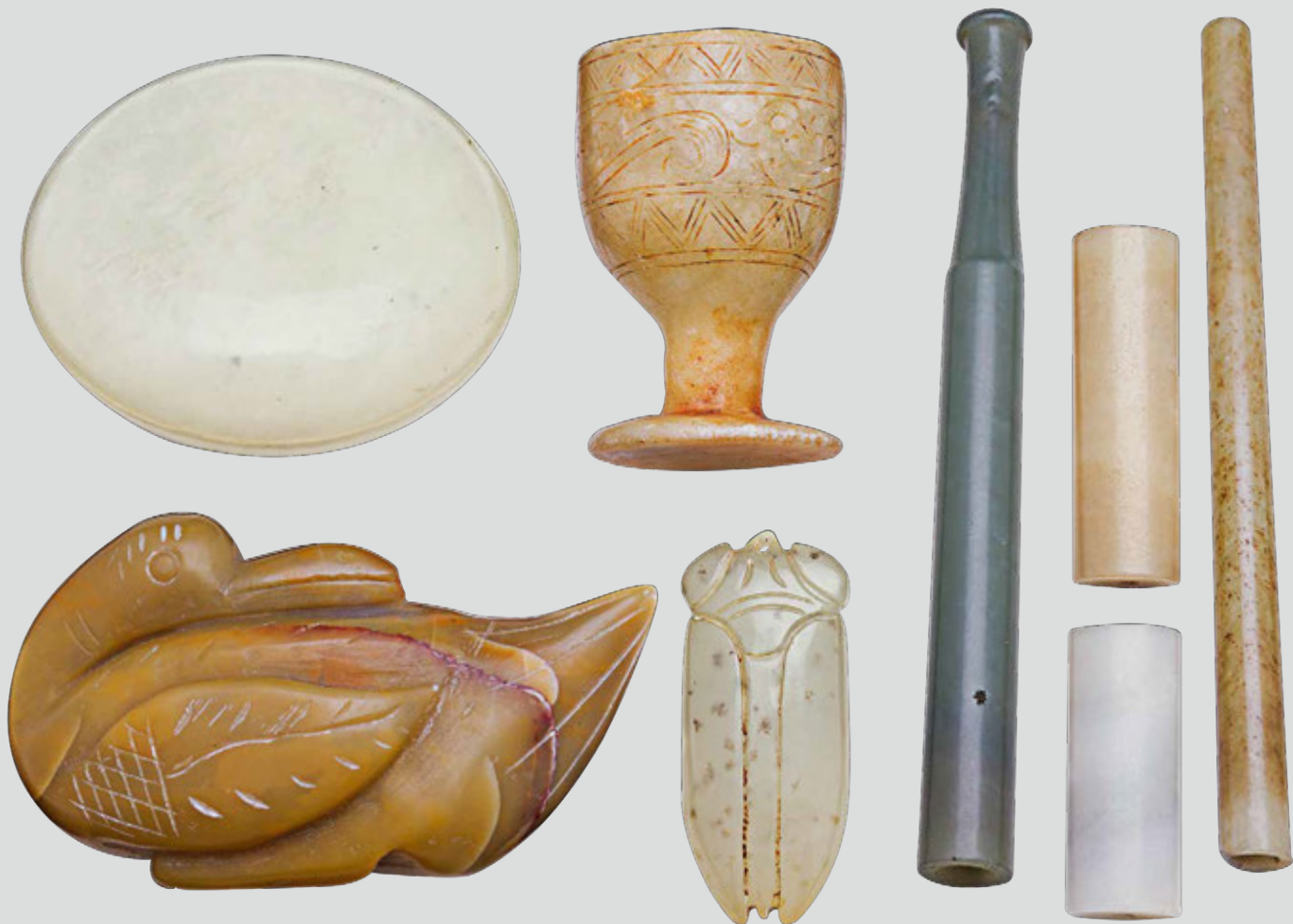
339 (8 pieces)

339 A GROUP OF SEVEN PIECES OF JADE ORNAMENTS, 5 TO 14 CM. 玉件一組共八件