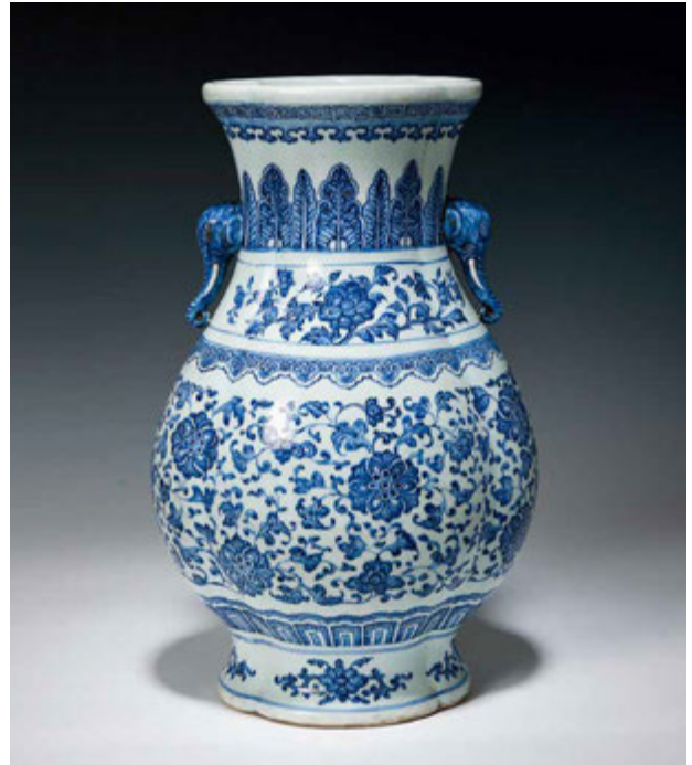
204 A BLUE AND WHITE VASE, QIANLONG PERIOD, FINELY DECORATED WITH LOTUS SCROLL, H: 37 CM. 乾隆 青花纏枝蓮象耳瓶