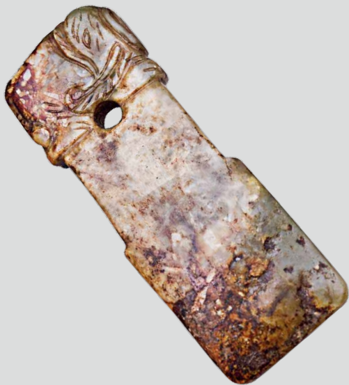
245 A CARVED 'ELEPHANT' JADE PENDANT, MING DYNASTY, 3 X 9 CM. 明 玉大象牌子 HK$5,000-8,000