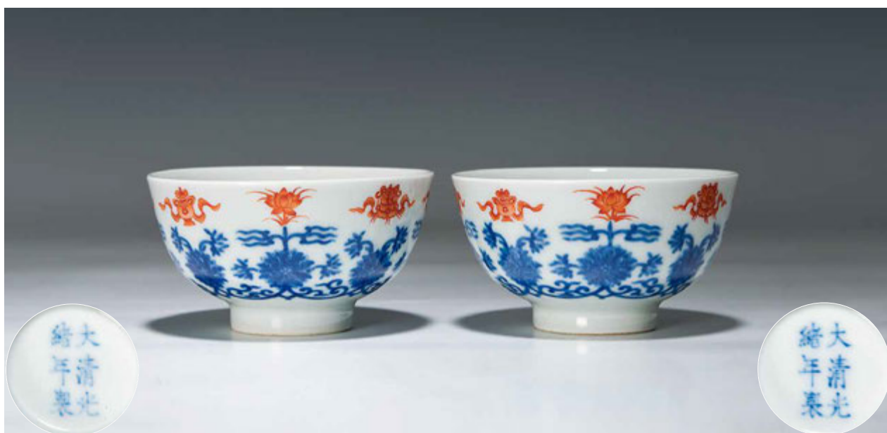
213 A PAIR OF UNDERGLAZED BLUE CORAL RED BOWLS, GUANGXU MARK AND PERIOD, 10 CM. 清 光緒 青花簪紅暗八仙碗一對