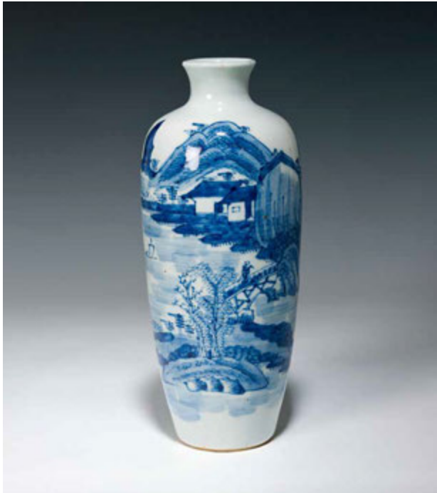
203 A BLUE AND WHITE VASE, 18TH CENTURY, FINELY DECORATED WITH LANDSCAPE AND INSCRIPTIONS, H: 27.5 CM. 清中期 青花山水詩文梅瓶