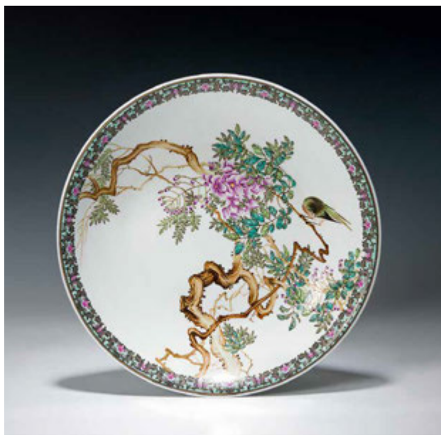
221 A FAMILLE-ROSE DISH, CIRCA 1955, D: 30.5 CM. 景德鎮美術陶瓷工藝社 1955 年造 粉彩花鳥賞盤