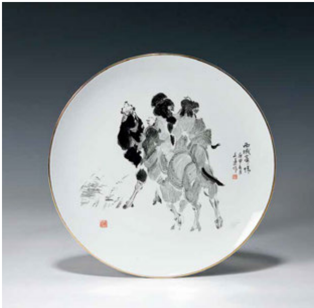
216 A FAMILLE-ROSE DISH BY GUO WENLIAN, FINELY DECORATED WITH FIGURE AND CAMEL, D: 23 CM. 景德鎮郭文連老師創作 西域風情賞盤