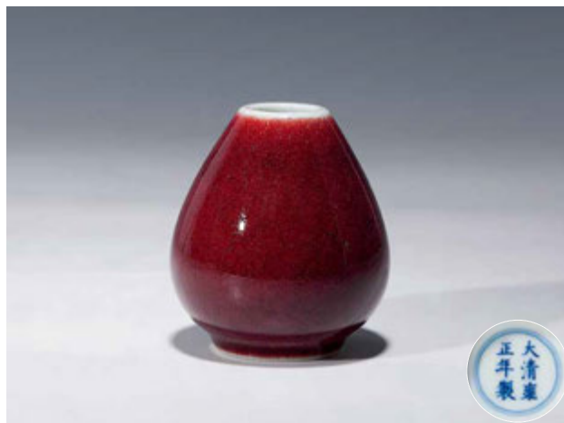
209 A COPPER RED WASHER, YONGZHENG MARK, H: 7 CM. 大清雍正 紅釉小水盂