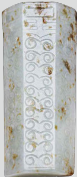
248 A CARVED RECTANGULAR JADE PENDANT, MING DYNASTY, FINELY CARVED WITH CLOUD PATTERN AND INSCRIPTION, 3.5 X 7.5 CM. 明 玉雲紋題字珮 HK$10,000-20,000