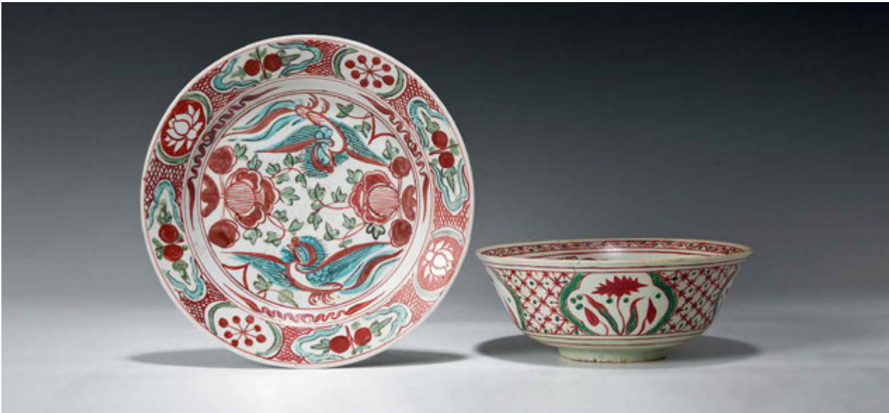
205 A GROUP OF TWO RED AND GREEN BOWL AND DISH, LATE MING PERIOD, 20 & 23 CM. 晚明 紅綠彩碗及盤共兩件