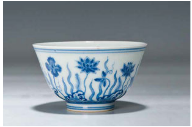
202 A BLUE AND WHITE CUP, KANGXI PERIOD, D: 8.8 CM. 康熙 仿成化 青花海草紋杯