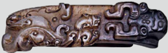
246 A GREYISH BLACK JADE BELTHOOK, MING DYNASTY, 8 CM. 明 黑提油螭龍文帶 HK$3,000-5,000