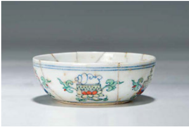
201 A DOUCAI CUP, CHENGHUA MARK AND PERIOD, 8 CM. (RETOUCHED PIECE) 明 成化 鬥彩小杯 (修復件)