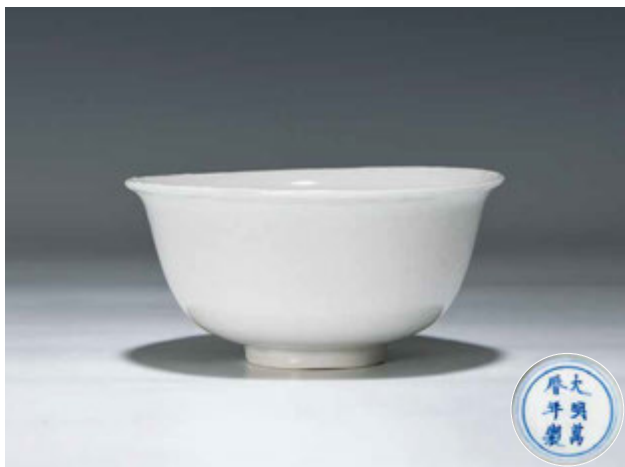
208 AN INCISED WHITE GLAZE 'DRAGON' BOWL, WANLI MARK AND PERIOD, 12 X 6 CM. 萬曆 白釉暗刻龍紋碗