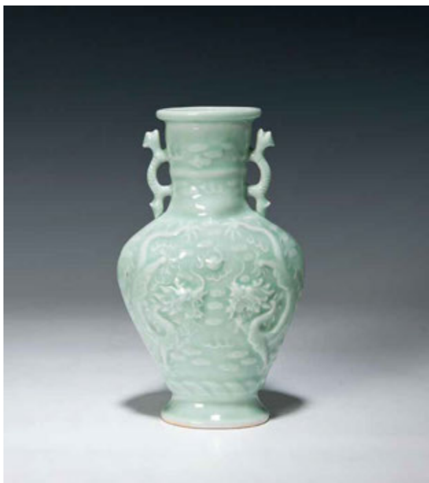
210 A MOULDED CELADON GLAZED VASE, REPUBLIC OF CHINA, H: 20.5 CM. 民國 青釉凸雕雙龍戲珠雙耳瓶