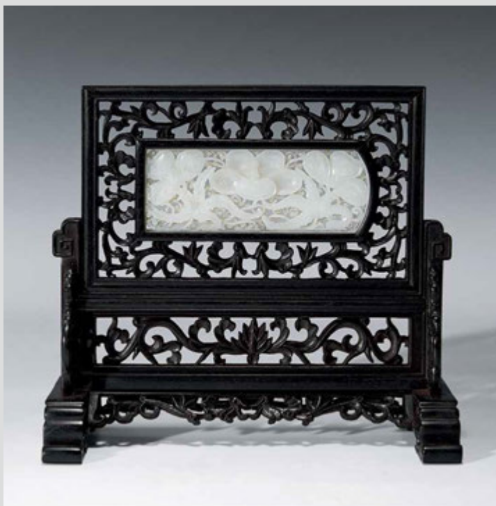
262 A CARVED WHITE JADE PLAQUE, YUAN/MING DYNASTY, SET ON A ZITAN TABLE SCREEN, 4.5 X 11.5 CM. 元 / 明 白玉透雕凌霄花帶版連梓檀木插屏