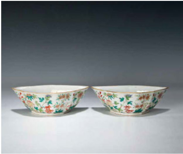
214 A PAIR OF FAMILLE-ROSE DISHES, DAOGUANG MARK, FINELY DECORATED WITH CLUSTER OF FLOWERS, 20 X 12.5 CM. 道光 粉彩花卉紋盤兩件