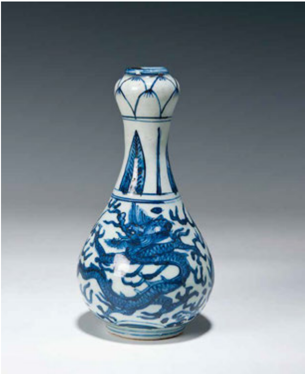
206 A BLUE AND WHITE GARLIC MOUTH VASE, MING DYNASTY, H: 17 CM. 明 萬曆 青花雲龍紋蒜頭瓶