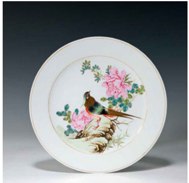
217 A FAMILLE-ROSE DISH, FINELY DECORATED WITH FLOWERS AND PHEASANT, D: 25.5 CM. 景德鎮陶瓷研究所創作 高白泥高白釉粉彩錦雞賞盤