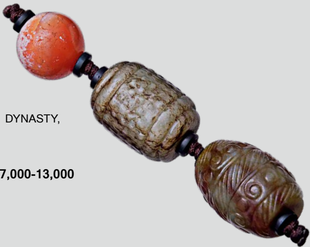
249 A GROUP OF TWO JADE PENDANTS, MING DYNASTY, 8.5 CM. 明 玉多寶串 HK$7,000-13,000