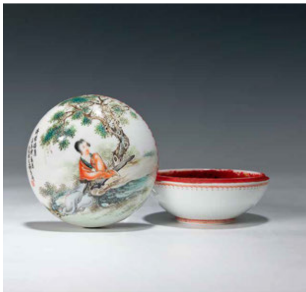
219 A FAMILLE-ROSE SEAL BOX AND COVER BY WANG XILIANG, FINELY DECORATED WITH LADY AND GARDEN SCENE, D: 10.5 CM. 王錫良 粉彩人物蓋盒