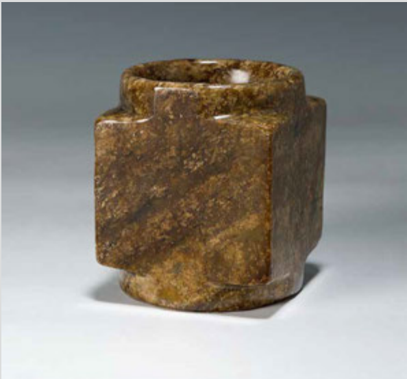
327 A BROWNISH JADE CONG, SHANG DYNASTY, 8 X 10 CM. 商 玉琮