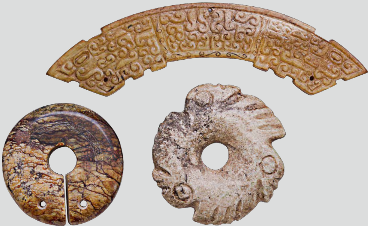
332 (3 pieces)

332 A SET OF THREE JADE 'DRAGON' PLAQUES, WARRING STATES/HAN DYNASTY, 5.5 TO 14 CM. 戰國 / 漢 龍珮一組三件