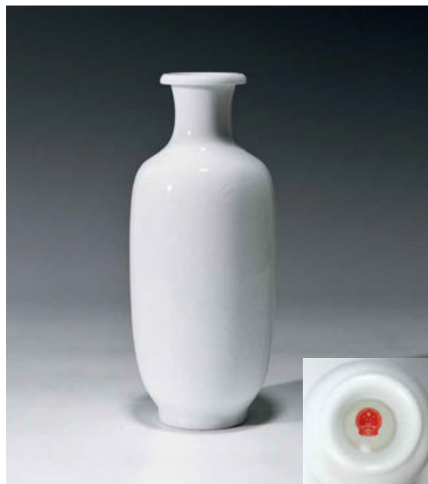
211 A CARVED WHITE GLAZED VASE, ZHONG NANHAI HUAI RENTANG, H: 23 CM. 中南海懷仁堂 白釉刻魚藻紋滿江紅詞毛像紋瓶