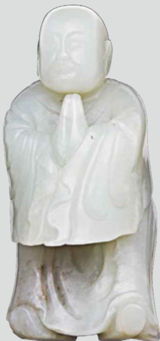
260 A WHITE JADE FIGURE OF LUOHAN, 16TH CENTURY, H: 9 CM. 清初 青白玉羅漢像