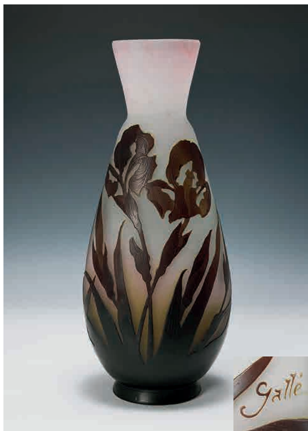
616 GALLE signed cameo glass vase, H: 40 cm. GALLE 花卉紋玻璃大瓶