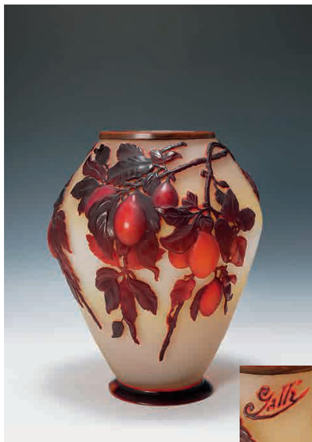
617 GALLE signed cameo glass vase, H: 32.5 cm. GALLE 花卉花果紋玻璃瓶