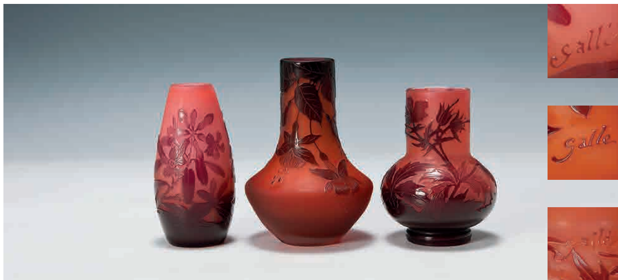
618 A Group of three GALLE signed cameo glass vases, H: 9 to 11 cm. GALLE 花卉紋玻璃小瓶三件