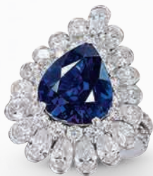
33 (Alternate View)