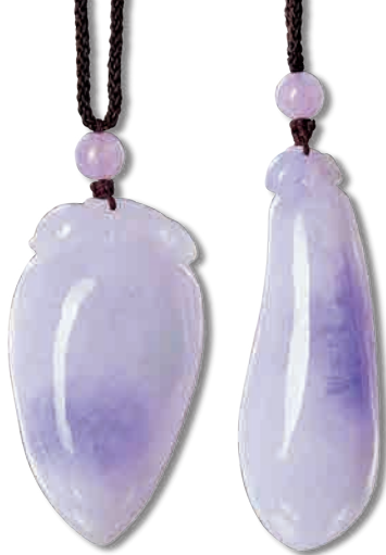
212 (2 pieces)