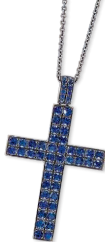
22 (2 pieces)