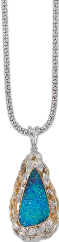
19 (2 pieces)