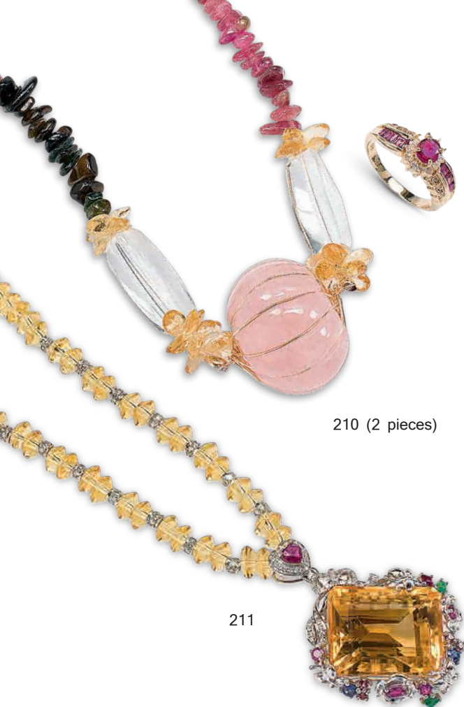
210 (2 pieces)