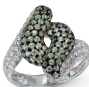
232 (5 pieces)

Orange-coloured Sapphire and Diamond Pendant, mounted in 18K white gold and Pink Sapphire Pendant, mounted in 18K yellow gold and 18K white gold Necklace, length approximately 405mm(3)