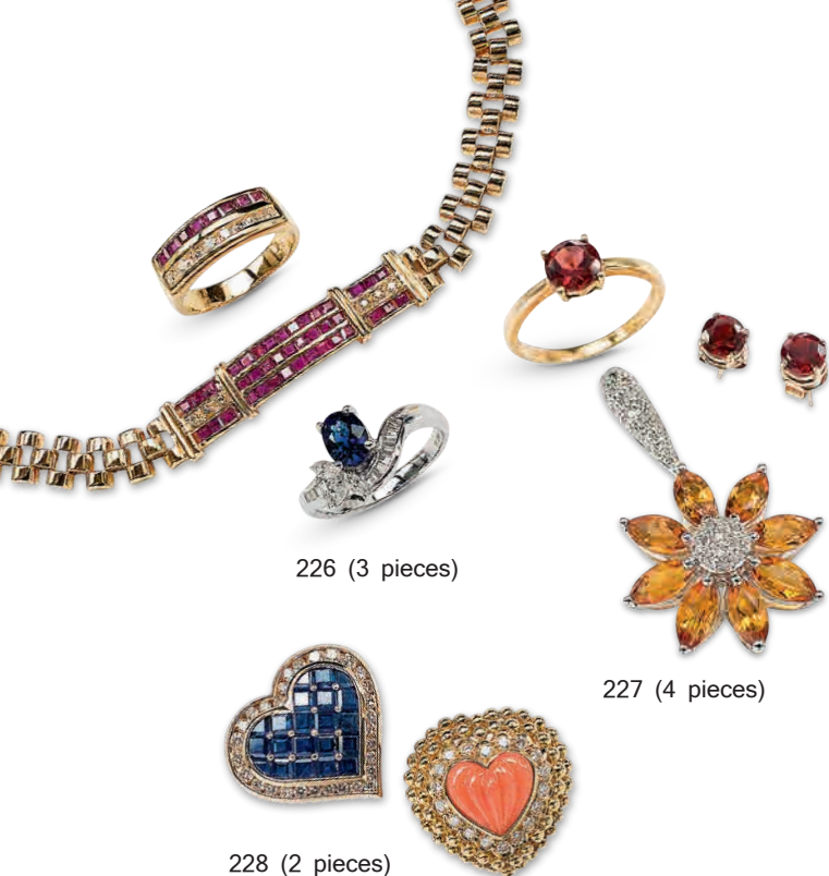
226 (3 pieces)