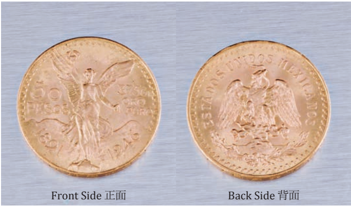
Front Side 正面