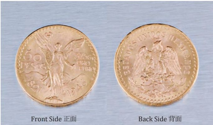
Front Side 正面