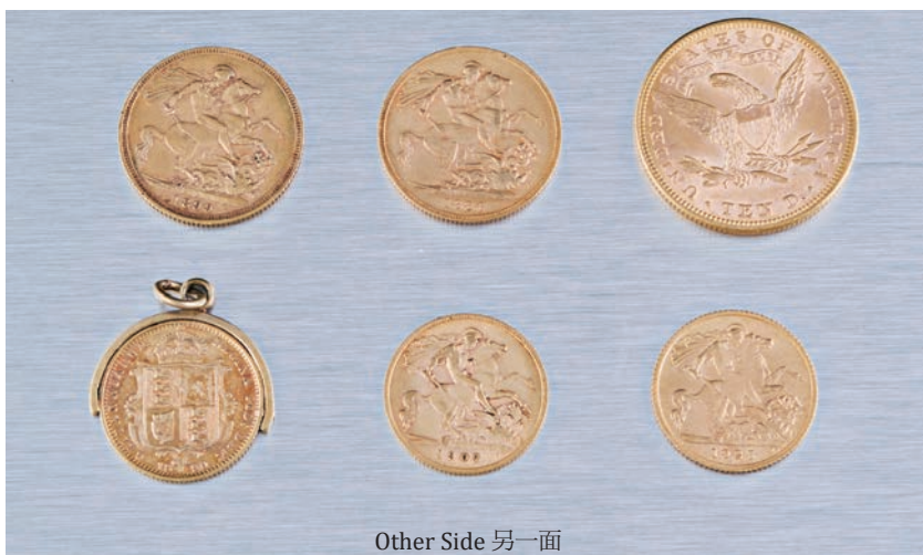
Other Side 另一面