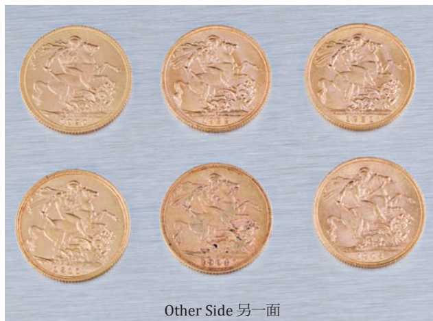
Other Side 另一面