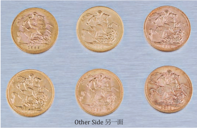
Other Side 另一面

610 Five pieces of Great Britain sovereign gold medal, 1900, 1912, 1929 & 1957, total weighing approximately 47 grams.