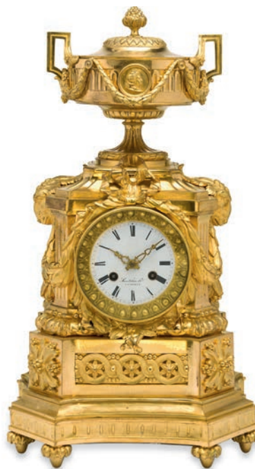
576 A FRENCH LOUIS XVI (16) TIMEPIECE, 51cm x 28 cm 十九世紀 法國路易十六 銅鑲金七天鏈半小時報時座鐘