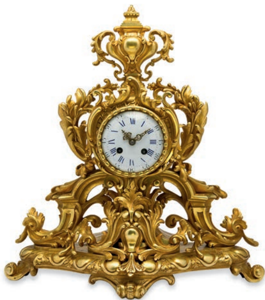
575 A FRENCH LOUIS XV (15) TIMEPIECE, 48cm x 43cm 十九世紀 法國路易十五銅鑲金八天鏈半小時報時座鐘