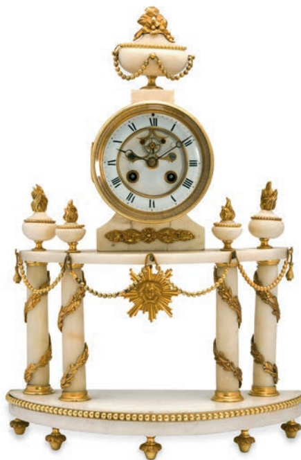
574 A FRENCH LOUIS XVI (16) TIMEPIECE, 44cm x 30cm 十九世紀 法國銅鑲金四柱大理石八天鏈半小時報時座鐘