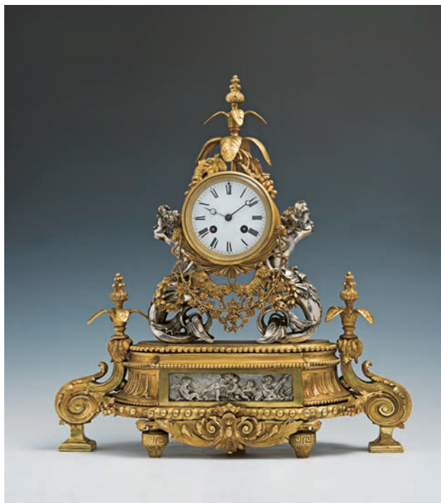
573 FRENCH LOUIS XV (15) STYLE TIMEPIECE GILDED AND SILVER PLATED BRONZE CLOCK, 47cm x 43cm 十九世紀 法國銅鑲金鍍銀七天鏈座鐘