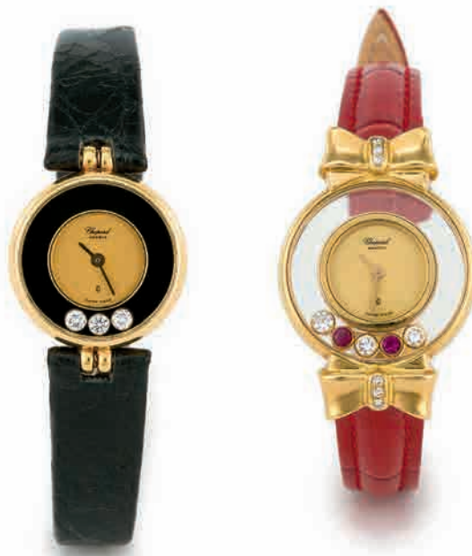
543 (2 pieces)